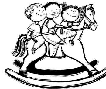
Robeson Township Play Group

Support our youth by buying gift cards and then designate your school rewards to our preschool! Thank you!!!